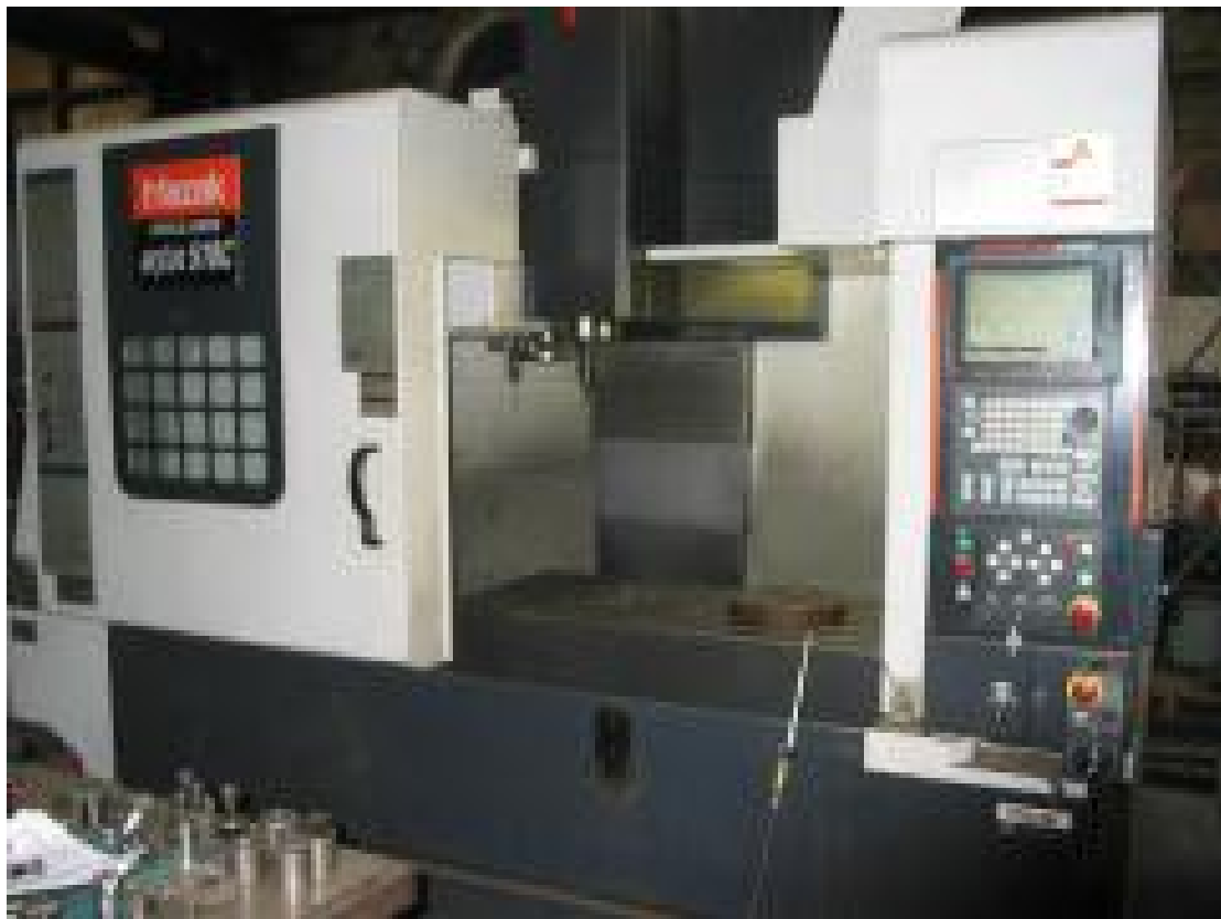
MAZAK NEXUS 510 VERTICAL MACHINING CENTER