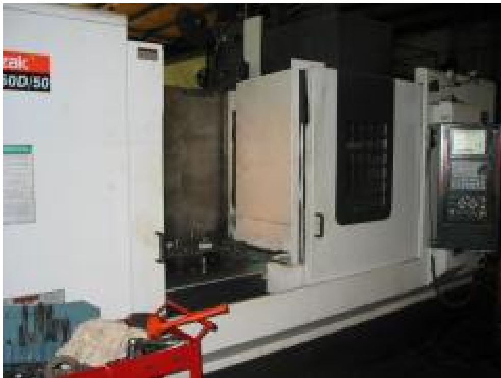
MAZAK VTC 250D/50 VERTICAL MACHINING CENTER