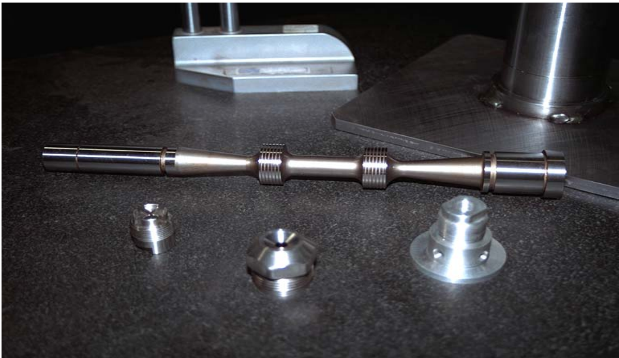
EXAMPLES OF MACHINED PARTS