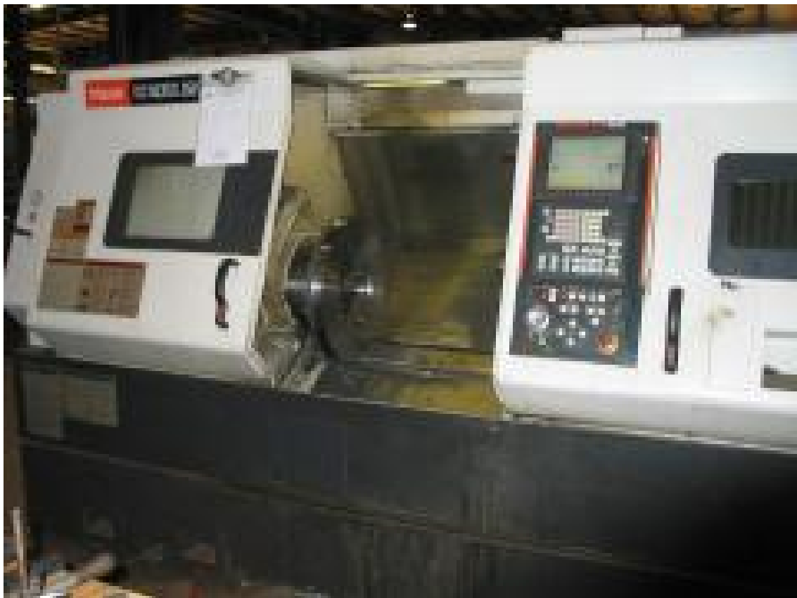
MAZAK NEXUS 350 LATHE