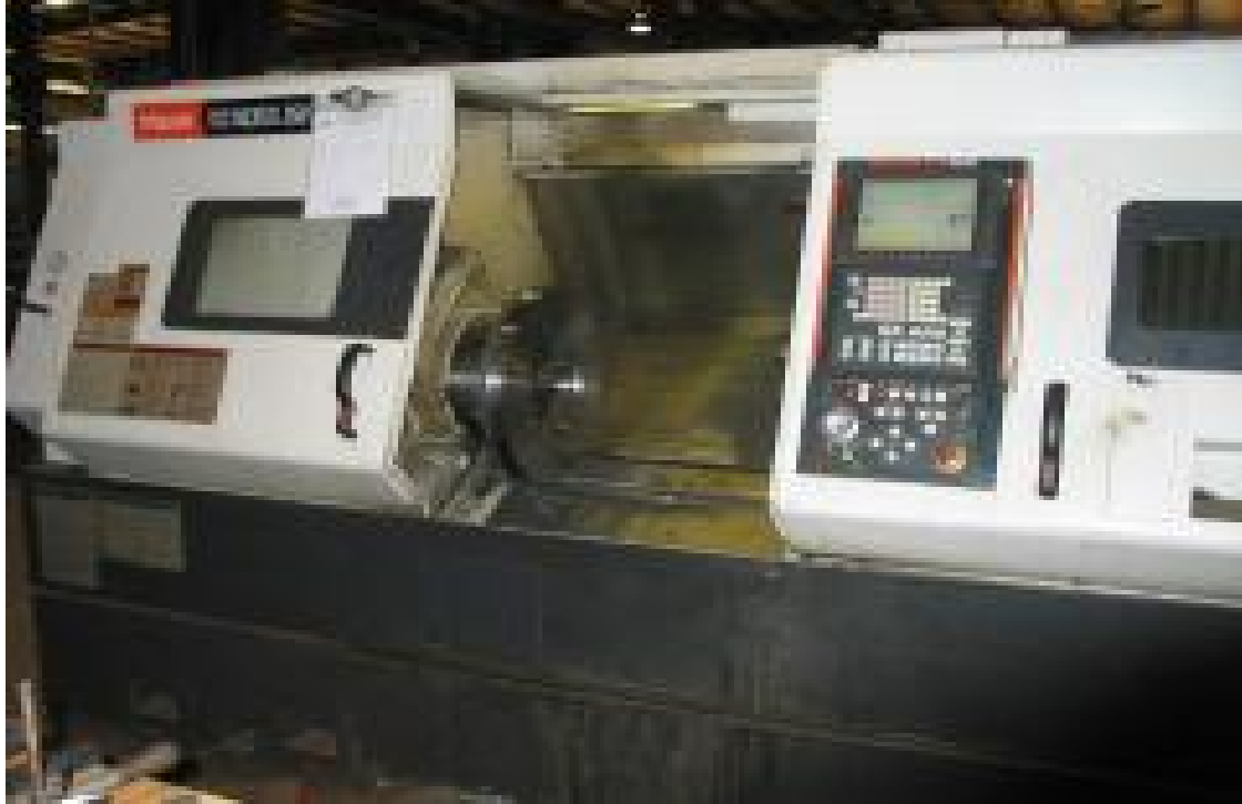
MAZAK NEXUS 350